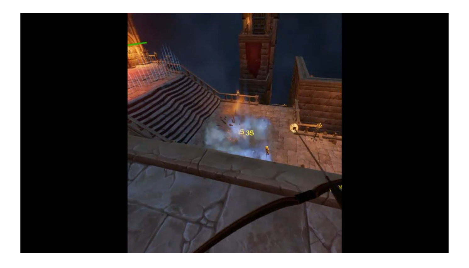
Download >>> <a href="http://bit.ly/2SV4tW1">http://bit.ly/2SV4tW1</a>